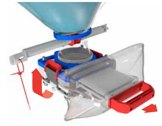
Pull out the front handle, marked number 2, to remove the active and passive sliders. Then raise the side toggles, marked number 3, to lock the system and create a contained seal.