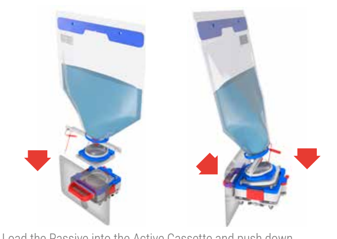
Load the Passive into the Active Cassette and push down at the rear