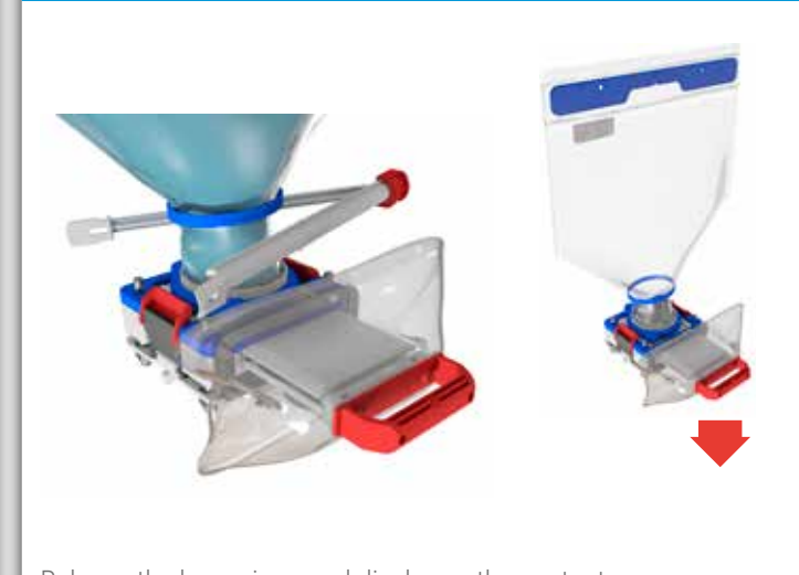
Release the bag gripperand discharge the contents